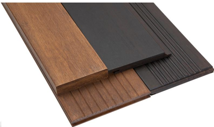
dassoCTECH & dassoXTR (Product)