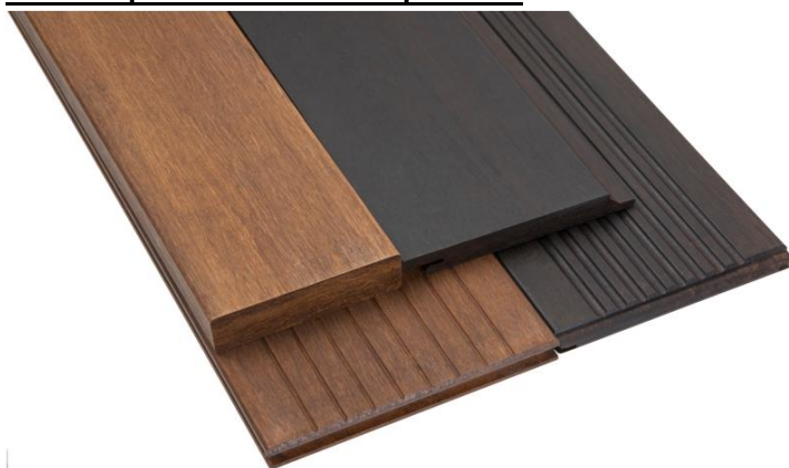
dassoCTECH & dassoXTR